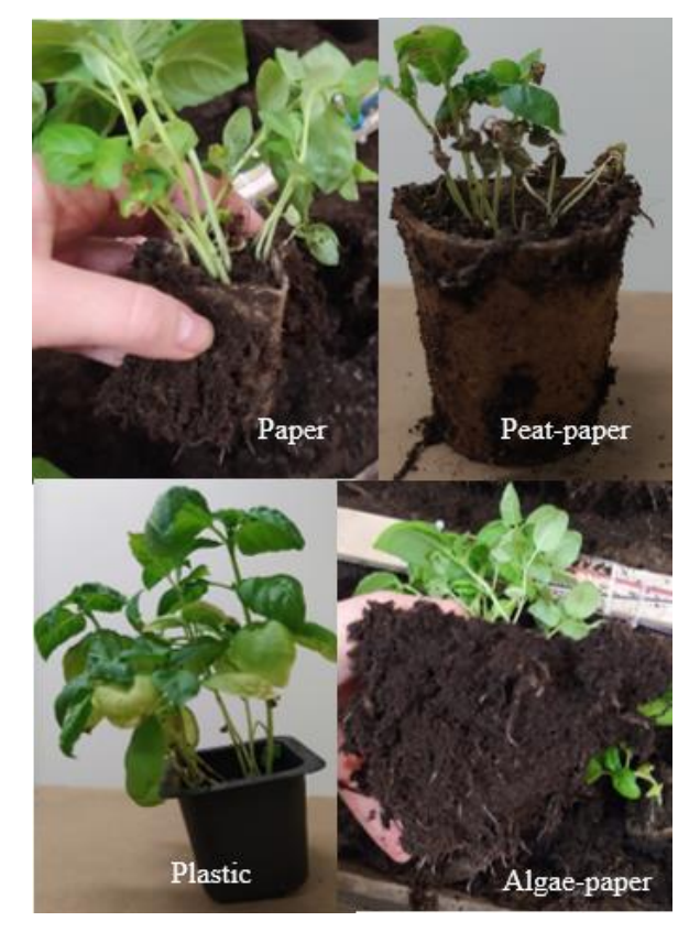
Fig. 3. Photos of the root system for each seedling pot type

Biodegradable seedling pots have been evaluated for their extensive use in horticulture, aquaculture, horticultural plantations, and even forestry. Long-lived (annual) plants and short-lived plants are tested in other scientific research by other scientists. Research on agronomic applications was carried out to ascertain the impact of different kinds of seedling pots [8], including the size and substance of the potting components on the agronomic performance of plants, including root length, plant height, plant weight, branch growth, shoots, and others. The findings of the observations also demonstrate the impact of seedling pots, which varies according to their size and composition. Unfortunately, seedling pots of any kind of algae composition material are not included in the mentioned study but are a great example of most common seedling pots and give reference points for creating new products from other materials and appropriate sizing guide for future comparison studies.